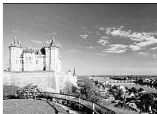
The elegant chateau at Saumur on the Loire

Star budget attraction: Wine cellar tours and tastings cost around two euros per