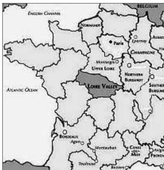
The Loire Valley is a favoured holiday destination for the French themselves

Carly Lockhart finds a treat for the tastebuds in the Loire Valley