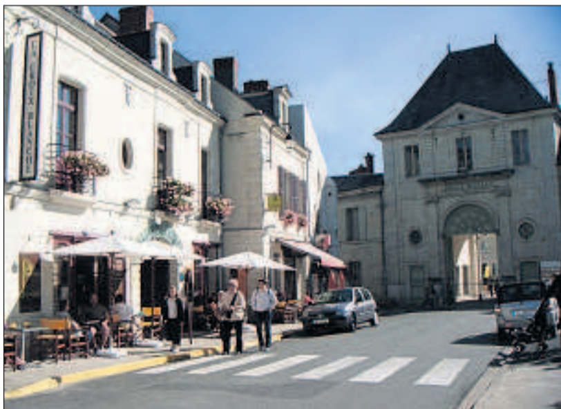
Hotel La Croix Blanche, next to the abbey in Fontevraud, is a fine mixture of luxury and history with an award-winning gourmet restaurant

There are some 7,000 winemakers in the Loire region and the landscape is studded with vineyards