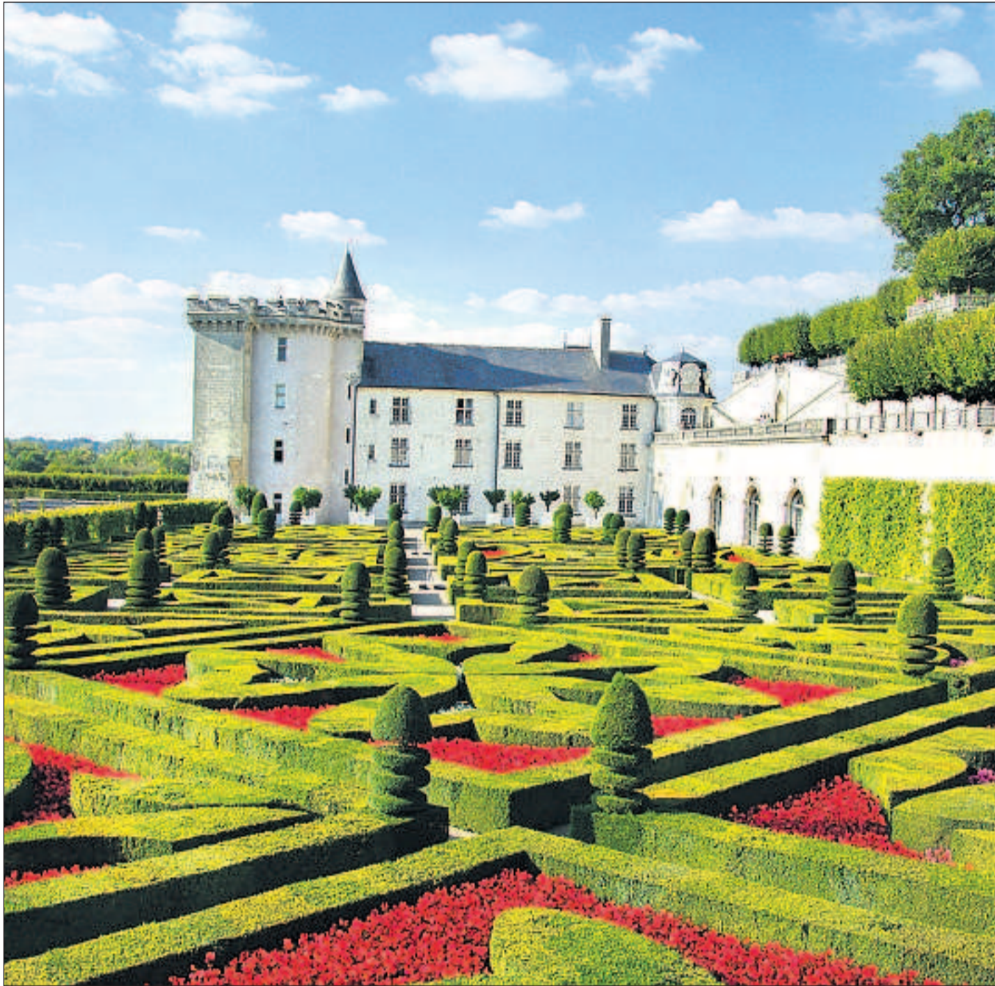
The Loire Valley is famous for its fairytale chateaux, such as Château Villandry (left), built in the early decades of the 16th century